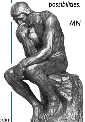
The Thinker by Auguste Rodin