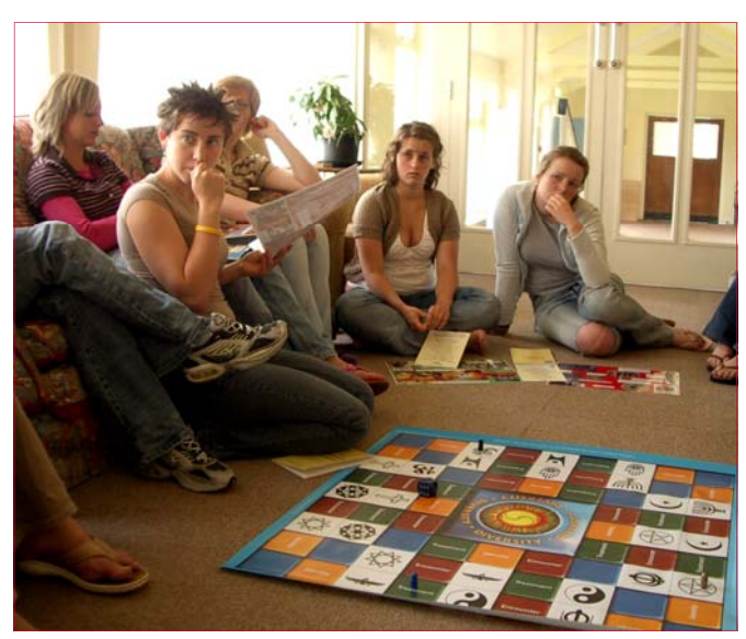
Girls from The Frances Bardsley School for Girls, Romford, play Diversity at St. Gabriel's Conference Centre, Ditchingham